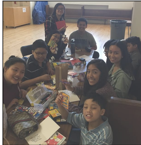
Junior Legion of Mary making Valentines for the Elderly