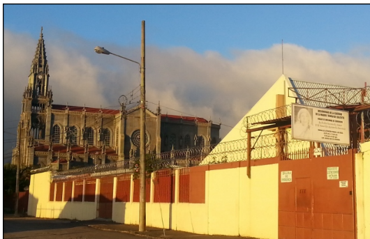
The Sisters' Convent in Costa Rica

The Priest is Not His Own Every Christmas the Archbishop sends each of his priests a book. I usually read my Christmas book during retreats for the Missionaries of Charity. Last week I gave a retreat in Costa Rica to fifteen sisters and was able to read this year’s book, The Priest is not his Own by Fulton J. Sheen. I must confess that it is the first book I’ve read by this famous author, and I’m wondering why it took me 26 years to discover him. I’m also wondering why