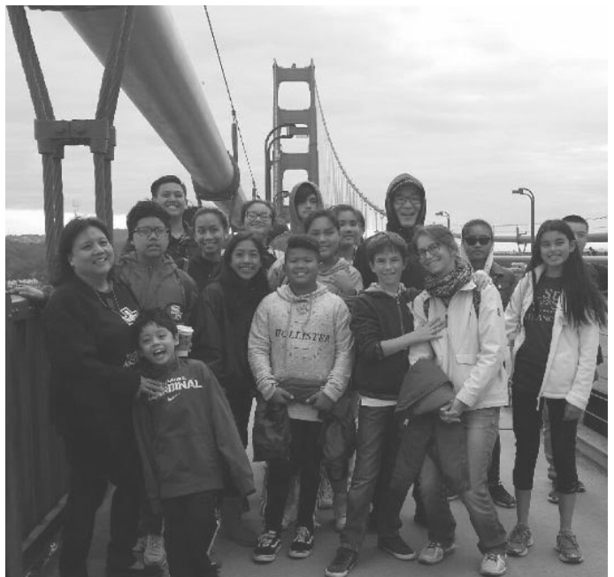
PSR and Junior Legion of Mary walk across the GG bridge and celebrate 1st Saturday of Our Lady