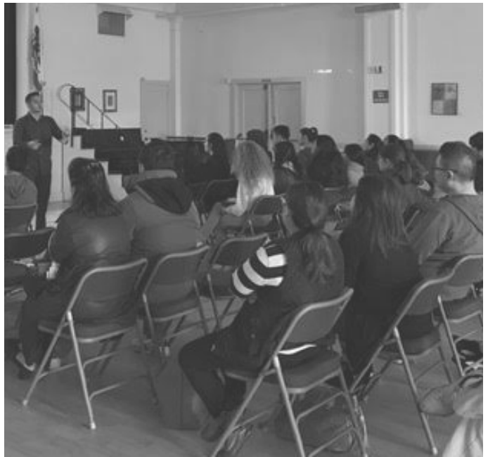
The 6th, 7th, and 8th graders with the Culture Project

The November 12th meeting is postponed. Please pray for prayer intentions for one of the members.