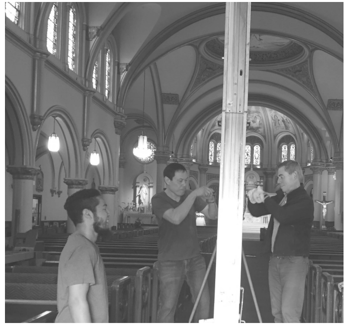
Taking down the old organ

As we embark on the busy-ness of this week, may we each strive to find God's love in ourselves and seek to discover His loving presence in one another.