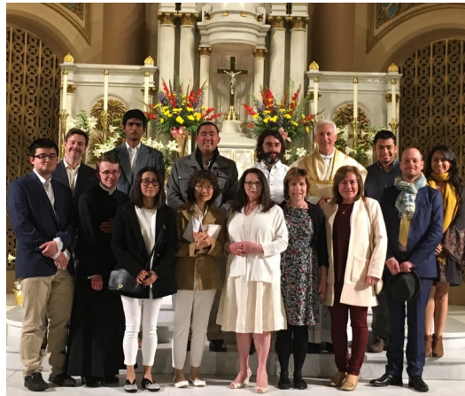
some of our newly-baptized this year

has been this year to spend this paschal season with you all! On Ash Wednesday we began worshiping ad orientem , facing the Lord together during the mighty Eucharistic prayer. Remember the stirring presentation on the Shroud of Turin? And on March 25 the Archbishop opened our adoration chapel, which has been full of prayerful souls since, day and night. Who can forget the Easter Vigil this year, or indeed the entire Paschal triduum, when the church was again full of a devout community? Eastertide has been so beautiful too, with devotions to Our Lady of Fatima, the Flores de Mayo procession, and our dear children crowning Our Lady. Today, Pentecost, brings all this to its rightful conclusion, with the outpouring of the Holy Spirit, the "birthday of the Church." I don't know exactly where the Holy Spirit is leading our parish and our Archdiocese, but I know that we need to beg for a double share of his grace. Without Him, as the ancient chant veni sancti spiritu : "thou our rest in labor, coolness in the heat, solace in our