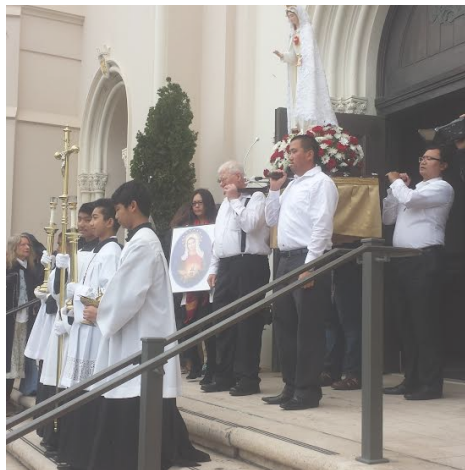
Procession of the Traveling Lady of Fatima Statue

Our parish is subscribed to FORMED.ORG. It's like a Catholic Netflix Secret code: