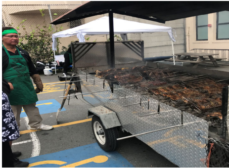
Serving the homeless (see left column)