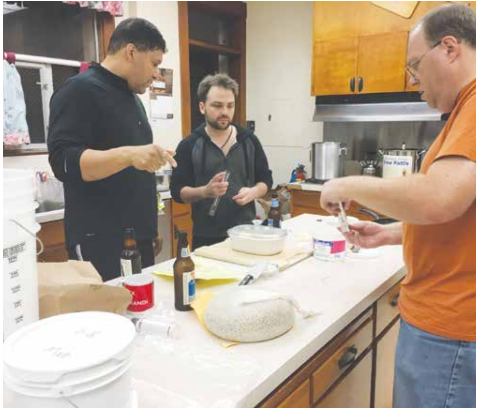
Our parish's St. Philip Neri Brewing Company is open to all parishioners who want to join in the experience of brewing their own beer.