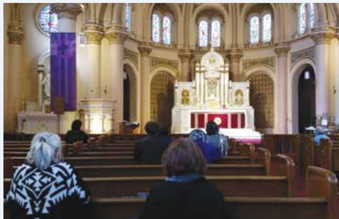
Eucharistic Adoration at Star of the Sea

In anticipation of the opening of the chapel and in order to foster a fervent love of Christ in the Eucharist, the parish hosted the Vatican’s International Exhibit of Eucharistic Miracles of