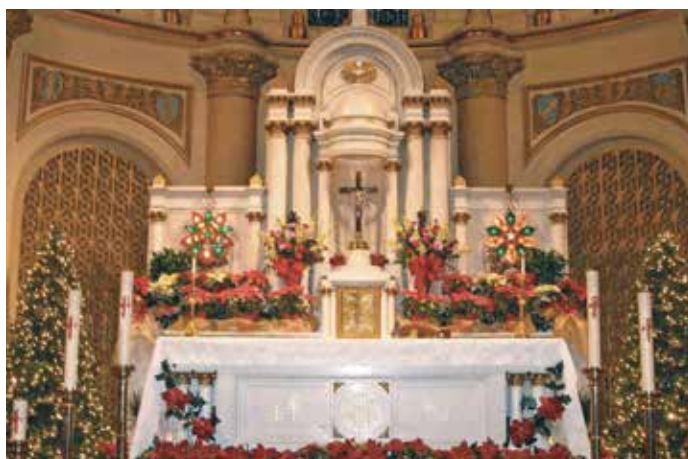
At Christmas, the Altar Society used an array of red poinsettias to highlight the white marble of the main altar.