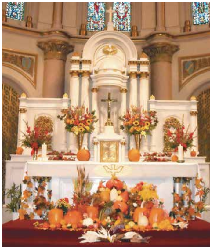
Autumn, Thanksgiving, and the harvest were the themes for this decor on the altar using pumpkins and fall flowers. Donations account for most of the flowers used throughout the year.