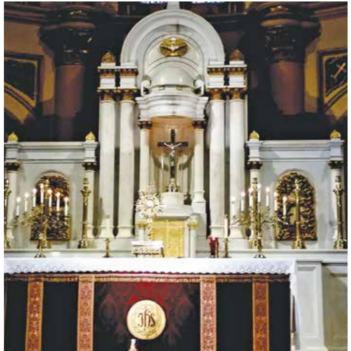
Eucharistic Adoration at Star of the Sea