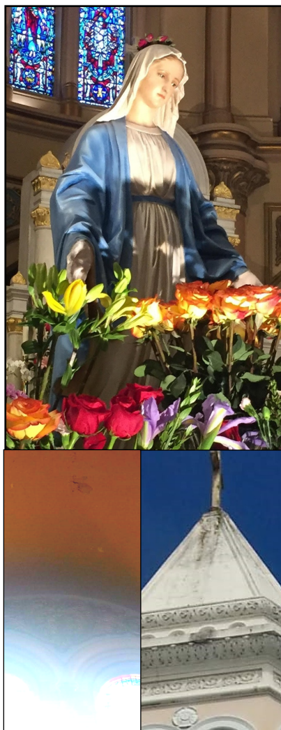
Some of the cracking paint and mold and tarnish on our beautiful church

check for $5000 last week to get our fund going, and I will add a thousand of my own. We are thinking of paving the greenway with commemorative bricks as well. If you would like to support the painting (and possibly flooring) project, and maybe get your name on a brick, call the office, or come to the dinner on Aug. 25.