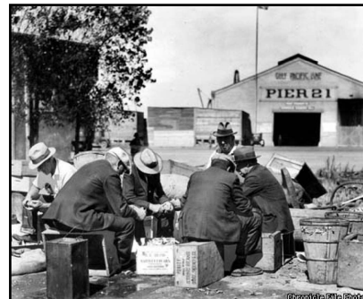
Unemployed discuss their work options at Pier 21

As we close out our yearly boiler maintenance, I am thinking of what work we undertake in 2018 will be in service 80 years from now and will it have stood the test of time as our boilers have. I would also like to thank those men and women of long ago who worked on our school and church to make it what it is today.