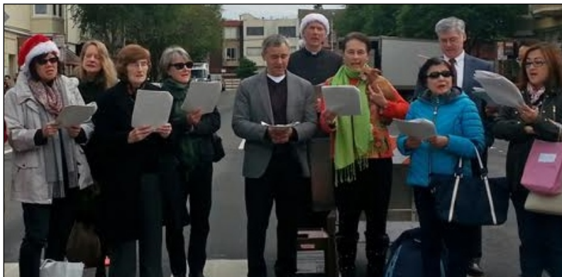
Christmas Carols at the Clement Farmer's Market in December 2016