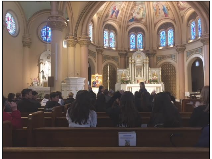
Lorna Feria leading Confirmation Rehearsal

Support the 6th graders outdoor education trip by getting your car washed on April 28, 10am -3pm in the parking lot.